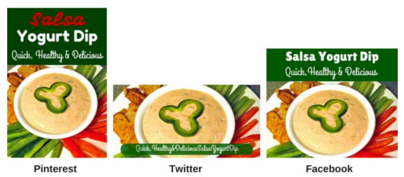
Figure 1: Optimizing images for different forms of social media (relative shapes and not sized to scale).